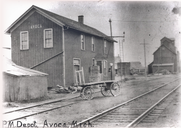
P.M. Depot, Avoca, Mich.