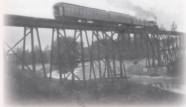
Above: A postcard from around 1900 shows a passenger train crossing the Mill Creek Trestle.

P. M. R. R. Bridge, 1-2 mile south of Avoca, Mich.